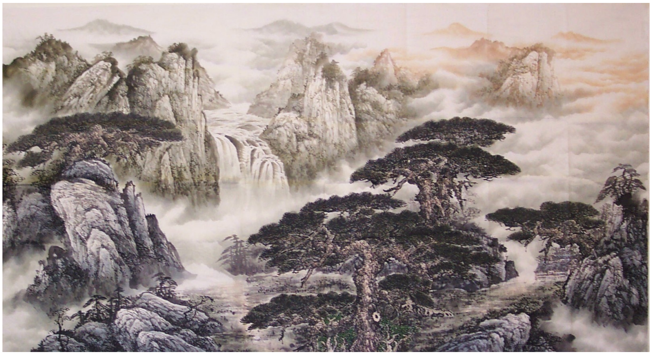
Landscape by Qu Leilei using many of the compositional elements